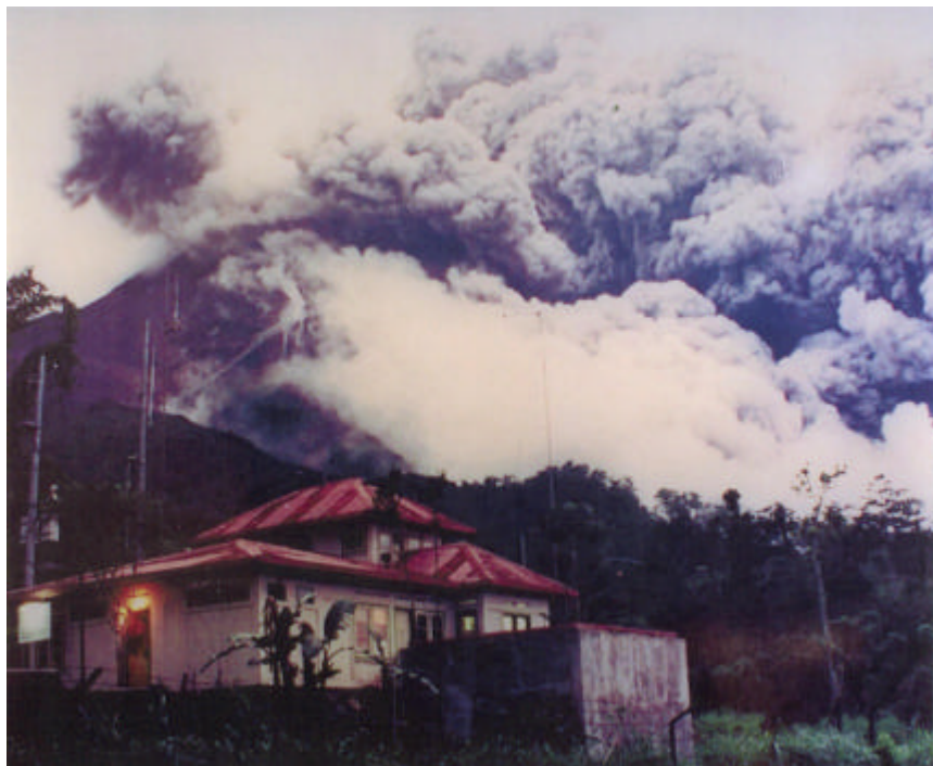
Eruption of M. Merapi

According to latest data provided by the United Nations Office for the Coordination of Humanitarian Affairs (OCHA), 5,778 people died due to the earthquake on 27 May; 38,000 were injured. More than 350,000 homes were damaged beyond repair, 280,000 other houses have suffered lesser damages. The directly affected population is 2.7 million people of whom 1.5 million were rendered homeless, three times the number in Aceh after the tsunami on 26 December